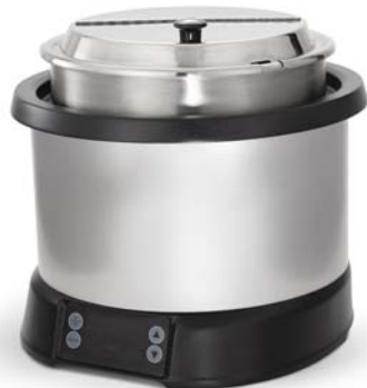
Mirage® Induction Countertop Rethermalizer