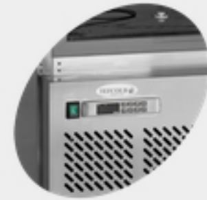
Core sensor included Programmable thermostat