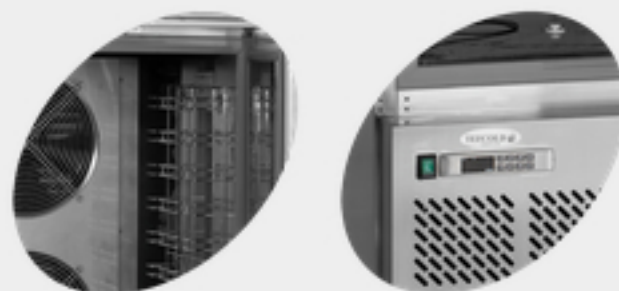
Guides for GN1/1 and Programmable Euronorm thermostat