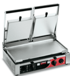
PD XX Timer