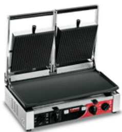
PD L Timer