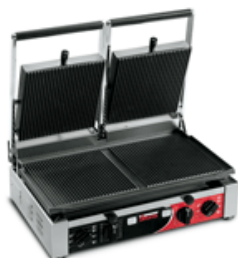
PD R Timer