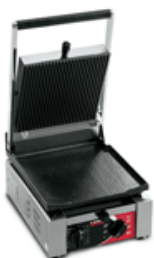
ELIO L Timer