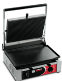
CORT L Timer