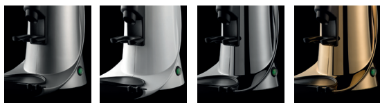
GREY METALLIC SILVER SNOW WHITE CHROME SILVER CHROME GOLD.