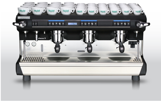
Classe 9USB - 3 groups