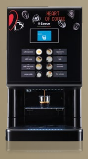
Phedra Evo Espresso