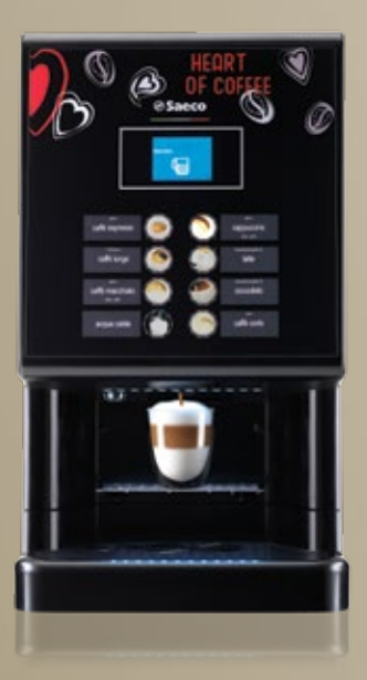
Phedra Evo Cappuccino

Water supply or internal tank or independent tank