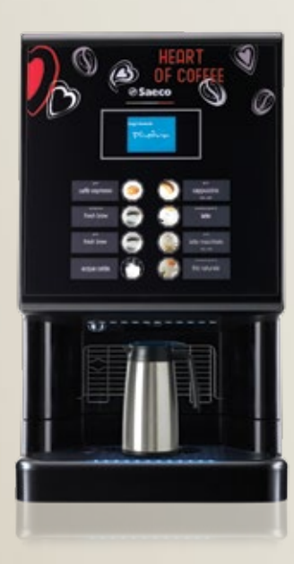
Phedra Evo TTT