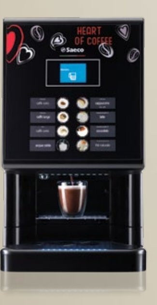
Phedra Evo Instant

Water supply or internal tank or independent tank