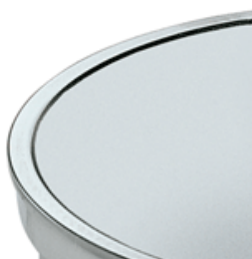
Surface with mould